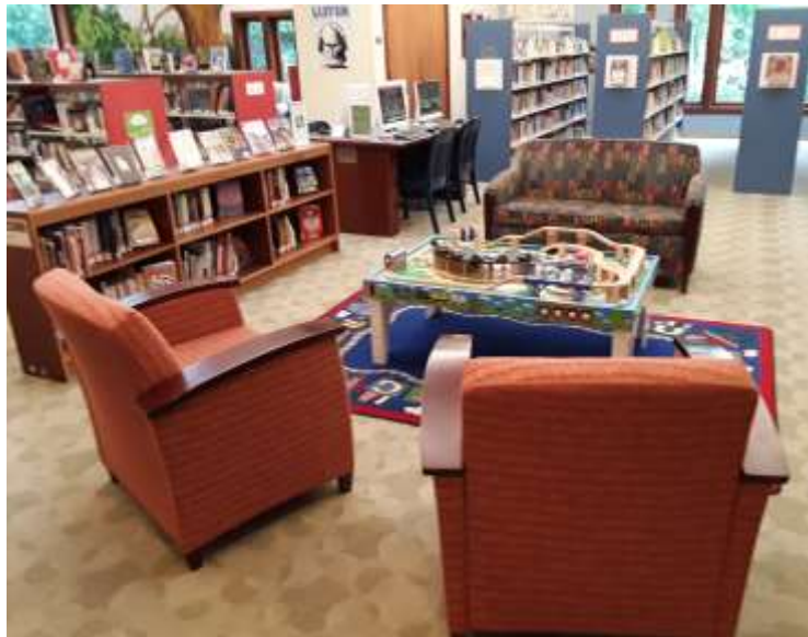
Sanitizing cars between use keeps our children's trains chugging during the Covid-19 pandemic

Covering the period from July 1, 2020 – June 30, 2021