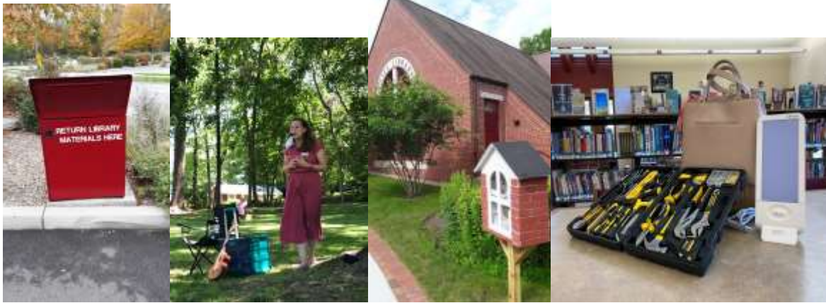
Photos, above: Our re-painted book drop; Stories in the Park; Little Free Library; Library of Things