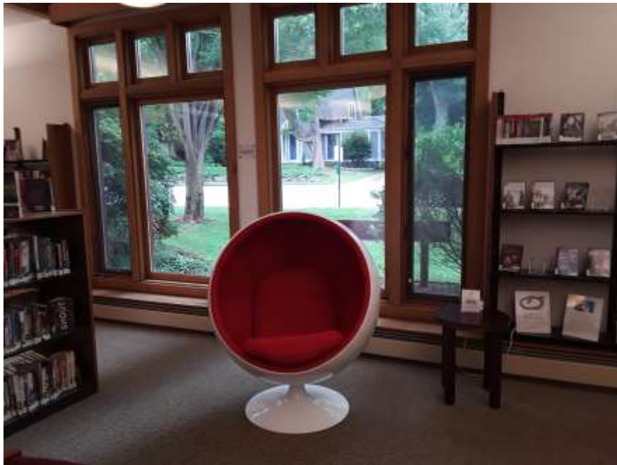
Above: The library received one-time funding for new furniture and equipment in FY22 as part of the American Rescue Plan Act