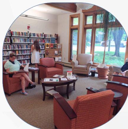
Adults enjoying the Library's periodical area.