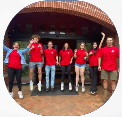
Warriors in the Community Day at Essex Library.