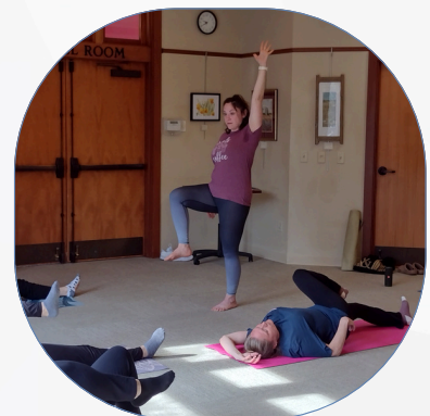
Fierce Spirit Yoga in the Buel Room.