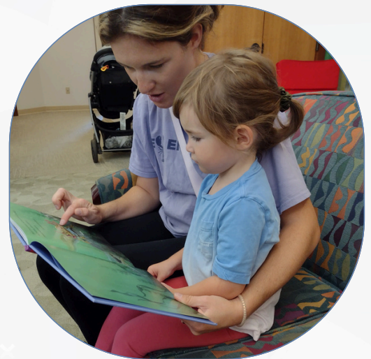
Sharing a Story in the Library.